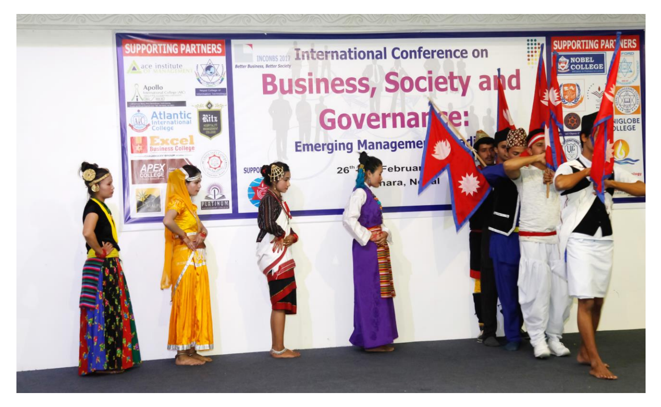
Cultural program at the valedictory session