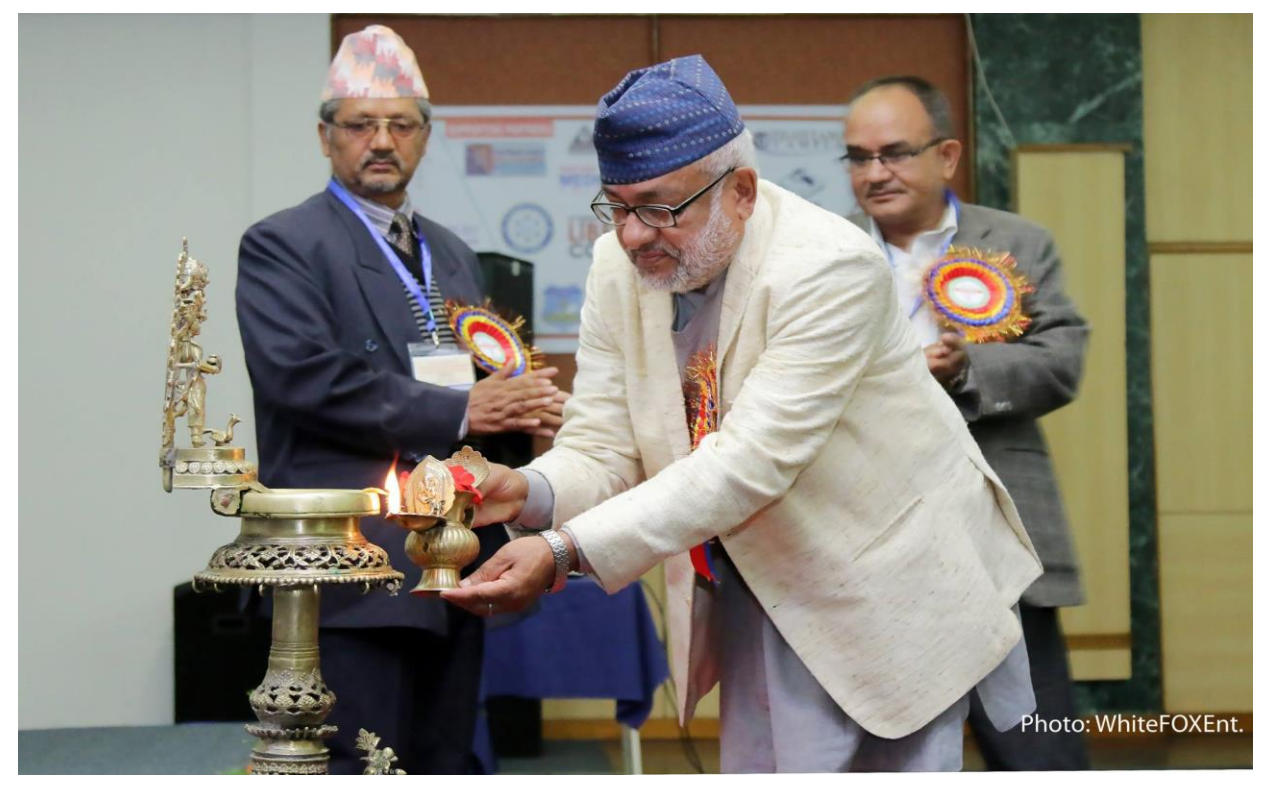
Inauguration by Honorable Vice-Chancellor