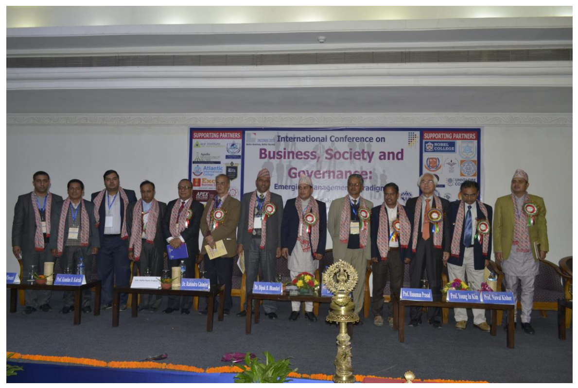
Conference Organizing Committee with Special Guests