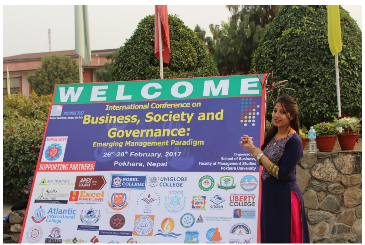
Welcome banner at the conference venue