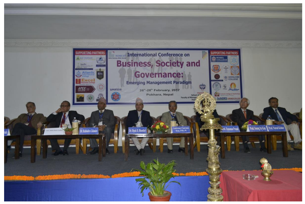
Closing Ceremony of the Conference