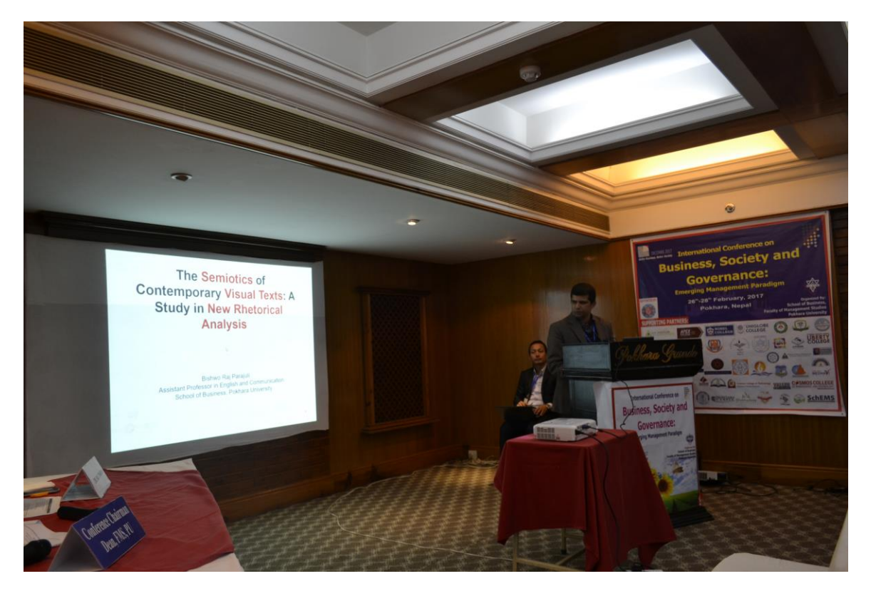
Paper presentation in a technical session