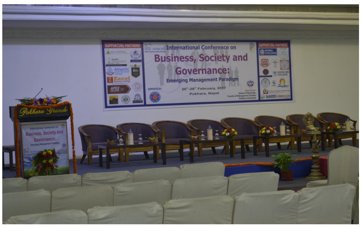
The Conference Venue (Main Hall)